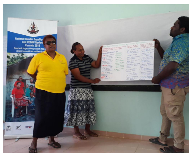
FIGURE 3: Government Joint Review of National Gender Equality Policy 7

This module has been developed to make sure women and all other marginalized groups in communities are involved in the training.