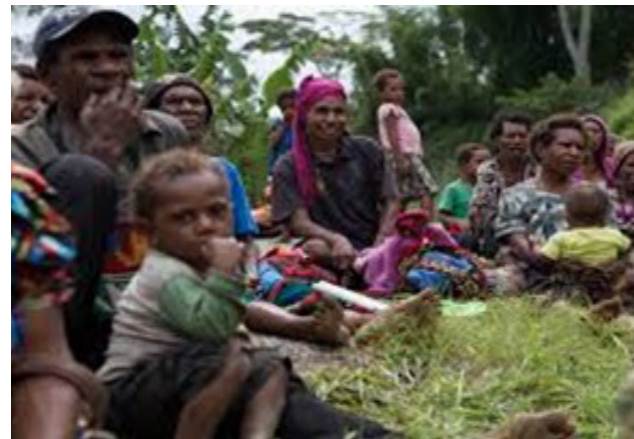
FIGURE 14: Care Climate Change – Enhancing Resilience through Gender Equality 27

This activity re-emphasizes an understanding of how inclusive or non- inclusive their community structure is.