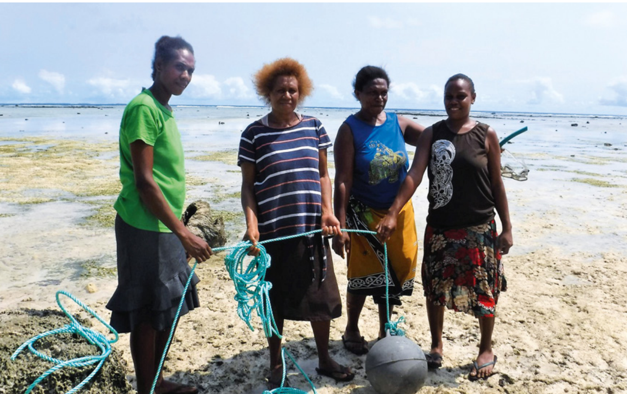
FIGURE 16: Women from Motalava Island undergo training at the site of first women-run conservation area in Vanuatu, which protects seagrass and a species of clam important 31

The purpose of this activity is for participants to identify through the activity who makes decisions in the community and who is excluded from the decision- making process and to understand ways to increase inclusivity in the community is by involving everyone concerned in consultations and decision making. Equal participation is a key principle of inclusive development.