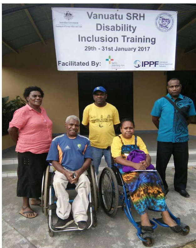
FIGURE 13: Vanuatu Sexual and Reproductive Health Disability Inclusion 25

Relatively large space, with room for 12 people seated in a circle, with the rest of the people arranged in a wider circle so that everyone can observe what is happening in the inner circle (the 'fishbowl').