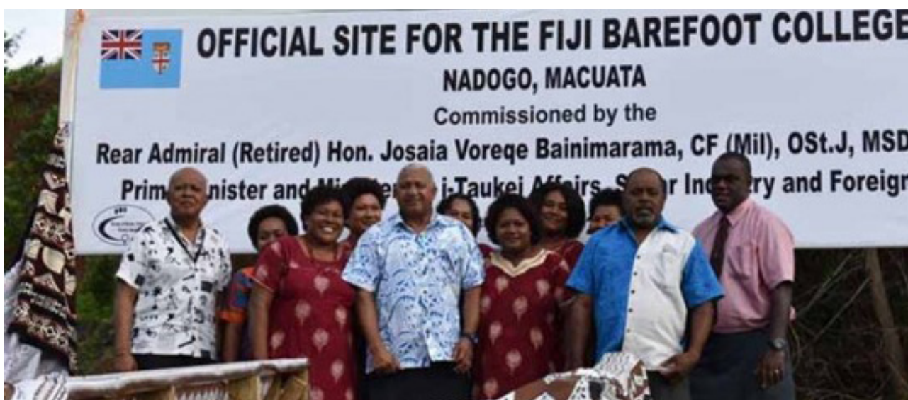
FIGURE 9: PM Opens Solar Electrification Training Centre in Nadogo, Macuata 17

The DoW recognizes women’s distinct roles also provide skills and knowledge with their contributions fundamental to development in remote villages. It is expected that the Solar Grandmothers will continue to expand their knowledge and expertise to train other grandmothers in Fiji and the Pacific region. Renewable energy is the only way forward for the future and Solar Home Systems are at the frontline of bridging the energy gap of the nation. 16