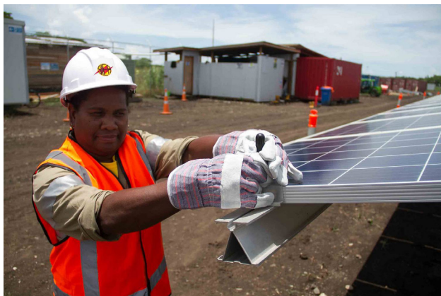
FIGURE 4: Women in Energy 11

This guide seeks to explain the above for the benefit of the trainer and to provide context to the one-day training on Inclusive Development.