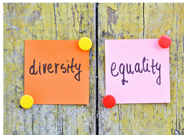
FIGURE 2: Equality and Diversity 4

Trainers can decide while conducting the training how much of this information is passed on to the participants.