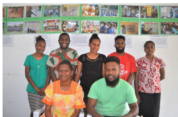
FIGURE 11: UNFPA Funding to boost Youth Development 21

Trainers need to be mindful of these barriers and assist participants to recognize them and be more committed and intentional by including youth, particularly those mentioned above in consultations and ensuring they access the energy services provided.