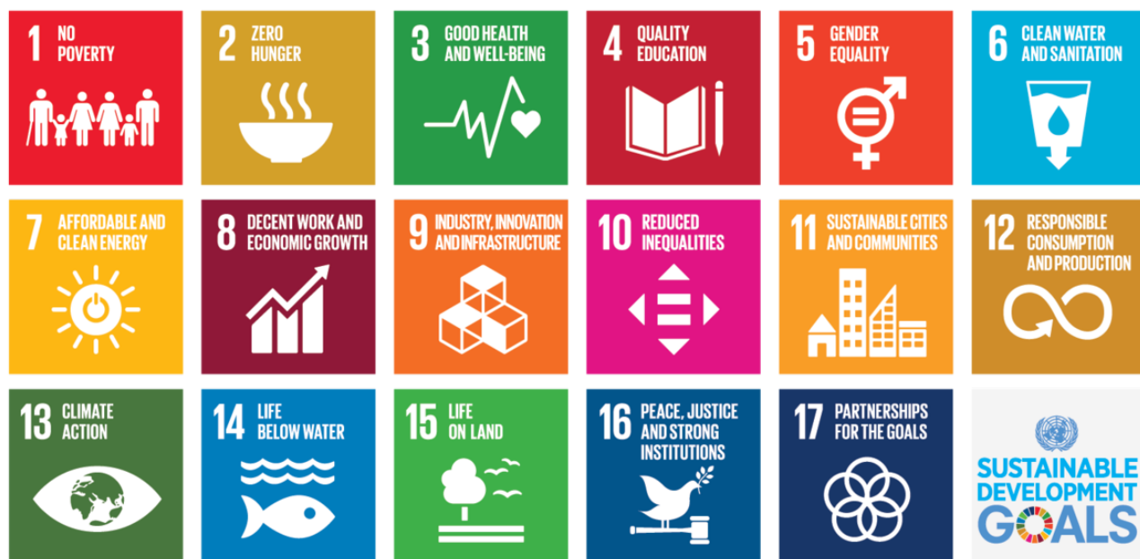
FIGURE 1: Sustainable Development Goals 2

There are 17 SDGs as given in Figure 1 below: