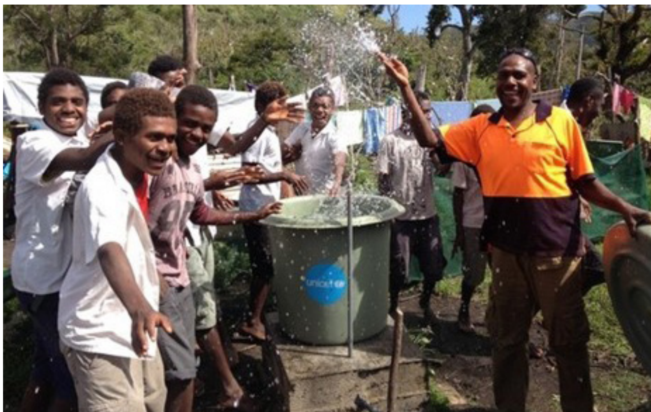
FIGURE 15: Convoy of hope, Vanuatu – Access to resources in natural disasters 29