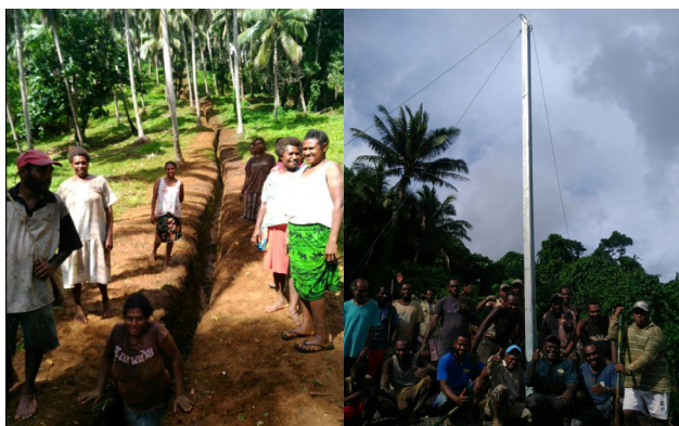
FIGURE 7 & FIGURE 8: Grid Extension works on Talise Hydro Project, Maewo 15