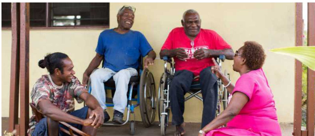
FIGURE 10: Vanuatu Society for People with Disability 19

Trainers need to be mindful of these barriers and assist participants to recognize them and be more committed and intentional by including persons living with disabilities in consultations and ensuring they access the energy services provided.