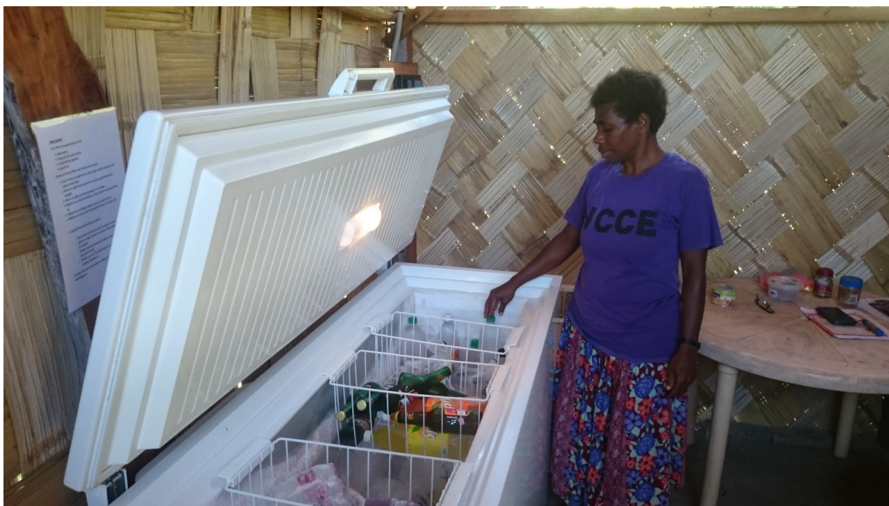
FIGURE 6: Success Stories, Pilot Project to install solar powered freezers in rural communities 14