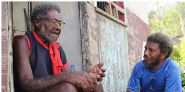
FIGURE 12: International Federation of Red Cross 23

Now that the Trainer has a sound understanding of regional commitments to the inclusion of the different vulnerable groups, the specific linkages between gender and energy and the importance of inclusion to ensure targets are met, this guide now looks at the recommended training program for the learning on Inclusive Development.